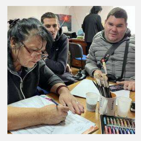
NGO Mozaik empowers people with disabilities in Montenegro