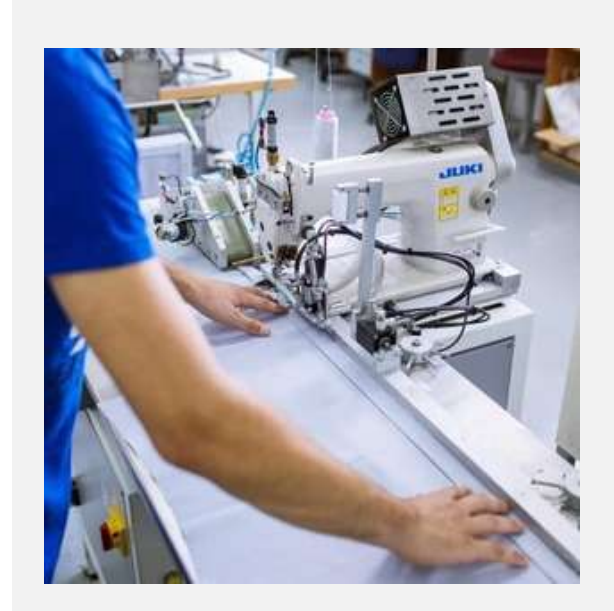
Bontex: Innovating the garment industry in Bosnia and Herzegovina