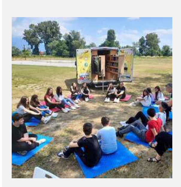
Reading throughout the Western Balkans