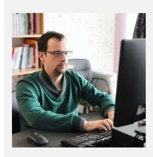
A friendly chat in times of need