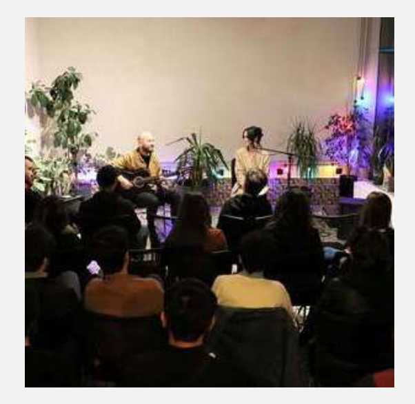
Better communication of projects on art, culture and public space