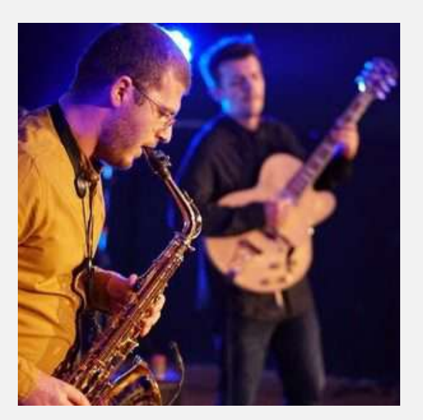
Jazz vibes make cultural spaces breathe again

On the trail of the endangered Balkan lynx