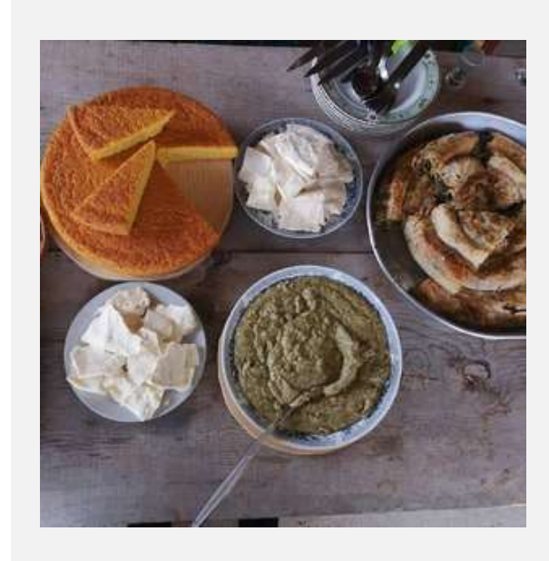
Local flavours meet global clients