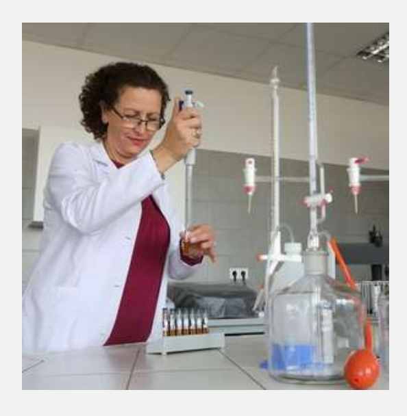
Pristine for Pristina! Safe water supply for years to come